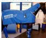
Champion Body Blanket

Our champion body blanket with 25 coils - especially for local therapy and enhancement of the performance of horses. This inner life may be removed for washing the coating. Massage function with 5 programs, 4 and 5 zones intensities.