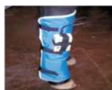
Gaiter (60 / 30 cm)

Cervical collar therapy for local treatment. Of course, with zipper for washing the coating, or for removing the coils.