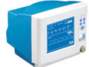
Model: MAX-E VET