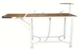
MODEL: XL-666 VET