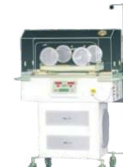
Model: SS-INC-150 VET