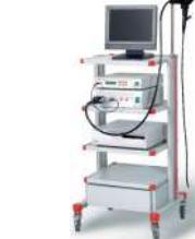
Model: SS-9215 VET-L