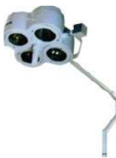
MODEL: SSML-4 VET

Dome: 1 no., Dome Diameter: 500 mm (nominal) Spring arm stroke: 750 mm +/-50 mm Field size: 150-200 mm, Action radius: 160° (Nominal) Light output: 1, 30,000 lux (max.) Color temperature: 4200 +/- 300°K Halogen bulb: 4 nos. 12V, 50 W each/24V 70W Filter: Glass for Heat Absorbing Low voltage unit with CVT: 1 no. Height Adjustment of Dome: 36° Mobile: Heavy duty Castors Outer Finish: Epoxy Coated with SS Arm and Base Sterilizable Autoclavable Handle Inbuilt Battery Backup (2 hrs.)