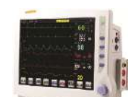
Model: MAX-69 VET