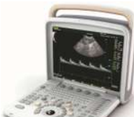
Model : DIGI 1100 CD VET