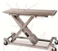
MODEL: XL-777 VET

Trendelenburg & Reverse Trendelenburg 35° Lateral Tilt Both side 22° Head Section Translucent detachable/ Interchangeable with head section 90° up (Optional in 3 Section Table) Leg Section 90° down (Manual) Flex/Reflex & Kidney Bridge 30°/220° 18 gauge (304) with 360° rotation of table top Overall length 60" Width over side railing 22" Height 42" Max. & Min 30" Lift 10/12 inch. Load bearing capacity 150 Kgs. Auto floor locks on any position and table on heavy duty castors.