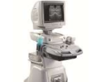
Model : SSD 6000 CD VET