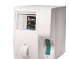
MODEL: SS-6800 VET