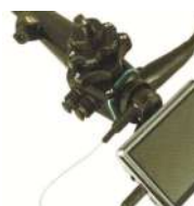
Model: SS-9215 VET-S