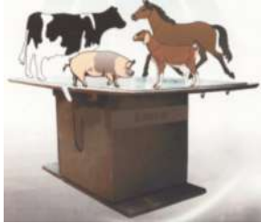
MODEL: XL-2000 VET

Heavy Duty sturdy design with 20 gauge SS. Durable & easy to clean. Large exam surface (150 x 60 cms including Flap 2" X 2") Strong tubular pipe frame of Ø 3 cm. Table top drainage facility in center Height can be adjusted manually Equipped with instrument tray on the head side with the facility to move. Facilitated with adjustable hobble pin to tie the animal IV stand for firmly fixing on all sides of tables Thick steering rings made of Stainless Steel of 3 cm diameter. Facility to hold Stainless Steel Tray 3" heavy duty locking castors hold the table securely in place for exams and roll easily even on uneven floors.