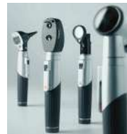
MODEL: SS-3000 VET