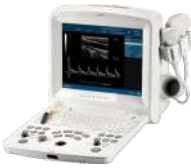
Model : DIGI 600 M PRO VET