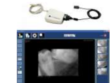
INTRASKAN digi RVG