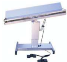
Model: XL-777 Vet CV

Overall length: 60" Width over side railing: 22" Height: 42" Max. & Min: 28" Lift: 14 inch. Load bearing capacity: 150 Kgs. Rotation: 360° around its axis. Table Top: High Grade SS (304 Satin Finish) 18 gauge Special Features Central Drainage System with feed silica flexible pipe. Hydraulic lift with pumping & rubber top paddle for lift and pressing down to glide table to lowest position. V-Cut position