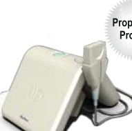
Mini Omni (BeamMed)