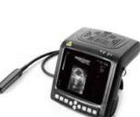
Model : DIGI 600 MW VET