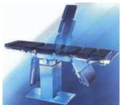
MODEL: XL-777 VET-E

Overall length: 60" Width over side railing: 22" Height: 42" Max. & Min: 30" Lift: 10/12 inch. Load bearing capacity: 150 Kgs. Auto floor locks for any position and table on heavy duty castors. Section: 1/3/5 section 14mm thickness (3 options available) Rotation: 360° around its axis. Table Top: High Grade SS (304 Satin Finish) 18 gauge Special Features Table has one end Tilt mechanism from horizontal to near vertical with lock at selected angle. Hydraulic lift with pumping & rubber top paddle for lift and pressing down to glide table to lowest position.