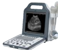
Model : DIGI 600 MBZ VET