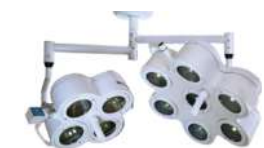
MODEL: SSCL-7 VET

Digital Control Panel with following systems: On-off micro switch with Focus control Intensity control micro system Time Delay circuit for the protection of bulb against sudden high voltage Higher depth of field ensures proper light without adjustment of focus even at different heights The operating lamps reduce shadows by throwing multiple beams using a multi source balanced optical system with honeycomb diffuser The advanced optics and halogen lamp produce the optimum color temperature for highlighting tissue with the minimum of eye fatigue Special mirror coating that reflects colder light but allows hot infrared light to go up