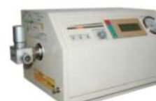
MODEL: SS-40 VET