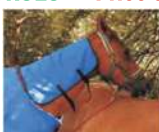
Cervical collar therapy

Our champion body blanket with 25 coils - especially for local therapy and enhancement of the performance of horses. This inner life may be removed for washing the coating. Massage function with 5 programs, 4 and 5 zones intensities.