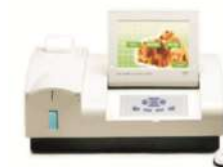
MODEL: SS-168 VET