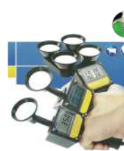
MODEL: SS-3000 VET