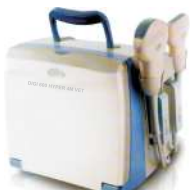
Model : DIGI 600 HYPER 4M VET