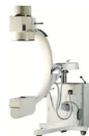
MODEL: SS-C VET