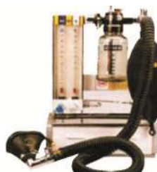
MODEL: SAAM-7 VET