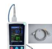
MODEL: SONO-OX-PL VET