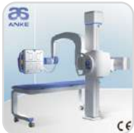
MODEL: ASR-9150-C VET