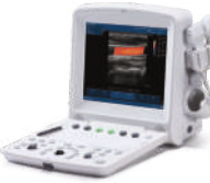
Model : DIGI 1100 CD-E VET